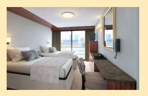
Deluxe Cabins with French French Balcony

2 adjustable twin beds - 12 m<sup>2</sup>