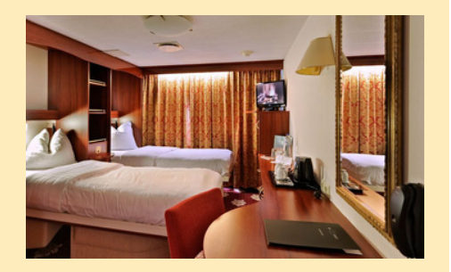
Standard Cabins with Large Windows

2 adjustable twin beds - 12 m<sup>2</sup>